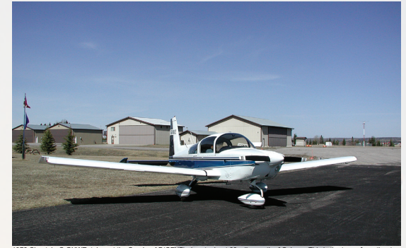
1978 Cheetah, C-GXWE, taken at the Sundre, AB(CFN7) airport, about 60 miles north of Calgary. This is the type of weather to be expected for AYA 2009 in Red Deer, Alberta.